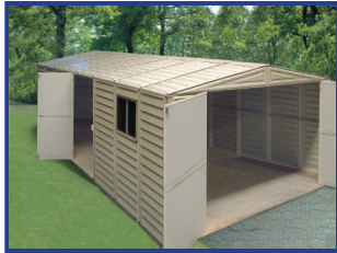
10.5' x 18'