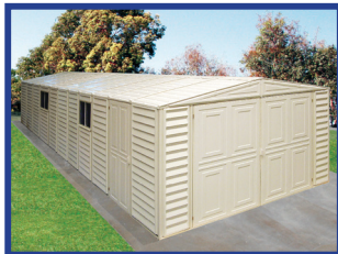
10.5' x 21'