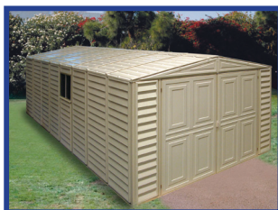
10.5' x 23'