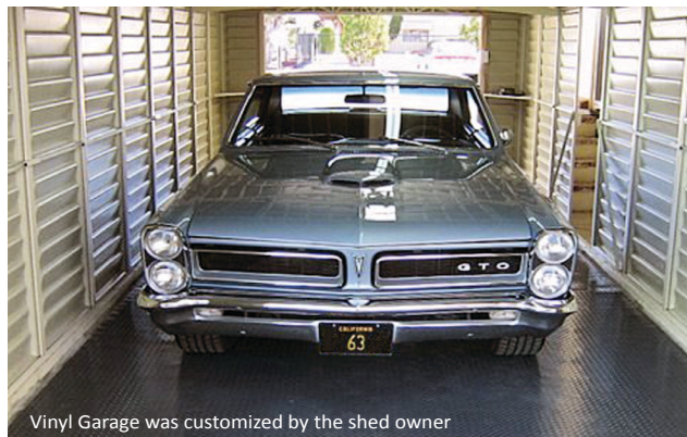
Vinyl Garage was customized by the shed owner