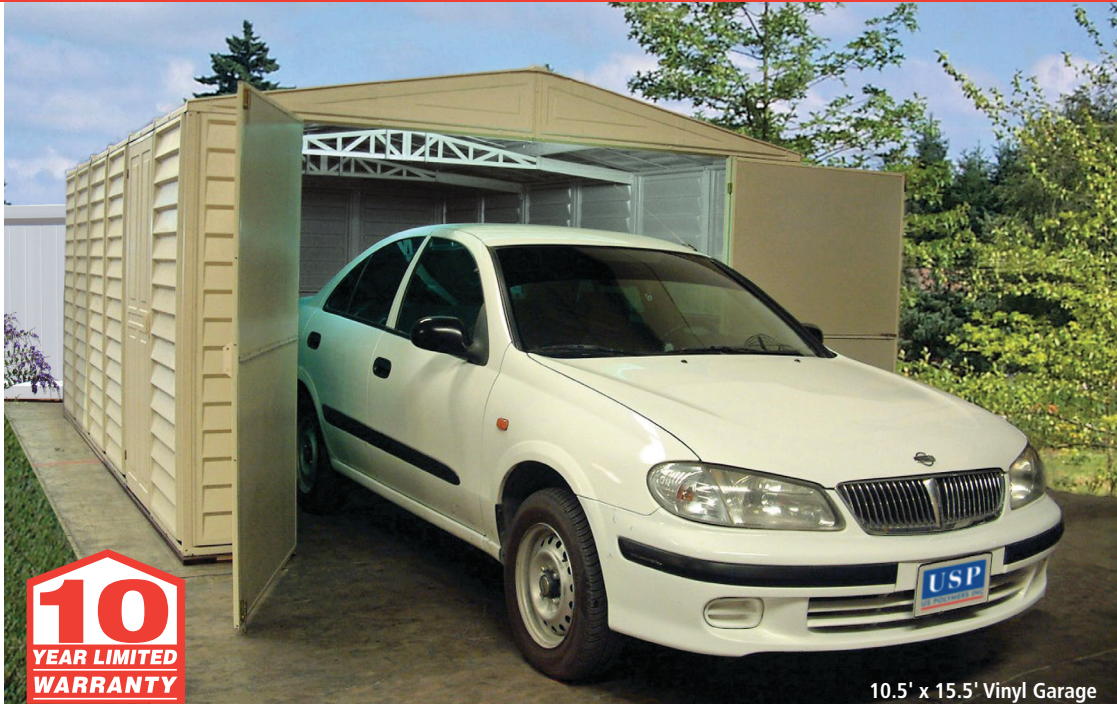
10.5' x 15.5' Vinyl Garage